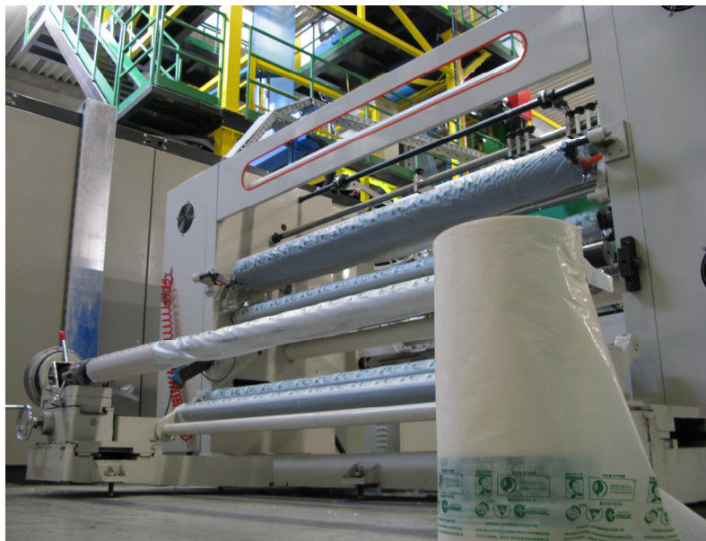
High tech equipment packaged in EcoCorr ® for export shipments.

Once put to use, Eco-Corr ® will remain effective with regard to mechanical strength until the film is placed in contact with material containing microorganisms, such as certain types of waste, soil, and compost. Under these conditions, 100% biodegradation into carbon dioxide and water will occur within a few weeks, with no residual contamination of the soil. Eco-Corr ® meets NACE TM0208-2008 and German TL-8135-002 standards for corrosion protection.