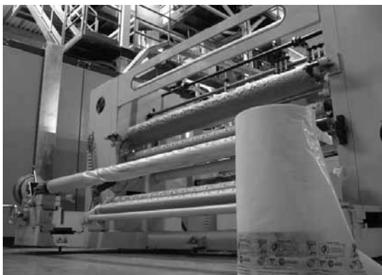
High tech equipment packaged in EcoCorr® for export shipments.

Once put to use, Eco-Corr® will remain effective with regard to mechanical strength until the film is placed in contact with material containing microorganisms, such as certain types of waste, soil, and compost. Under these conditions, 100% biodegradation into carbon dioxide and water will occur within a few weeks, with no residual contamination of the soil. Eco-Corr® meets NACE TM0208-2008 and German TL-8135-002 standards for corrosion protection.