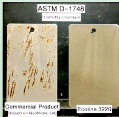
Naphtenic oil at left and Ecoline 3220 at right.

Ecoline 3690 offers an open air corrosion protection and is can serve as a replacement for more expensive solvent-based rust preventatives. Made from renewable materials and containing canola oil as a carrier, it has good thermostability and no effect on rubber, plastics or paints. This coating is designed for marine and high humidity conditions. The film is self-healing and moisture displacing, providing protection against aggressive environments.